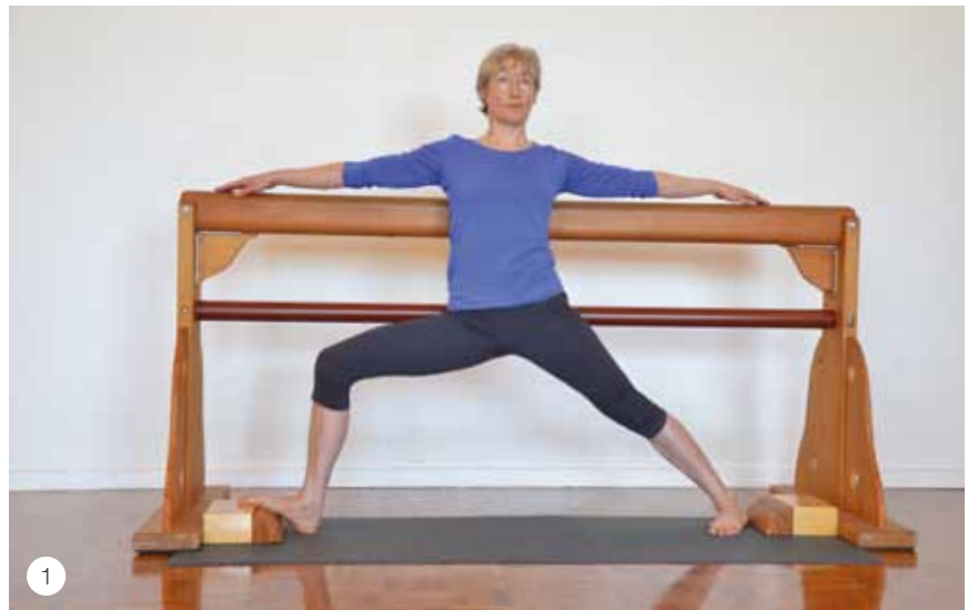
PHOTO 1. The trestle or the wall can be used for those with balance problems in standing asanas.

For those without the strength to hold themselves, various forms of support are available.