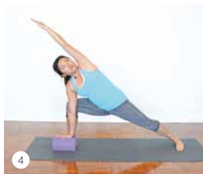
PHOTO 4. Blocks for stability in standing poses.

Props are most often taken to achieve stability in asanas. Overreaching and poor alignment bring with them physical and mental strain and unsteadiness. Iyengar's approach emphasises precision and stability in alignment before depth. Props are an invaluable aid in this regard.