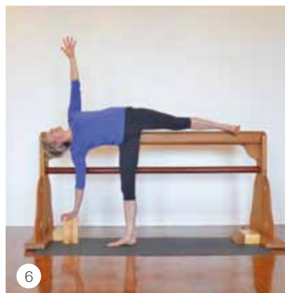
PHOTO 6. The trestle for stability in Ardha Chandrasana.