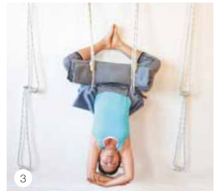
PHOTO 3. Full inversion suspended in ropes.