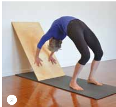
PHOTO 2. Dropping back to Urdhva Dhanurasana on the kickboard (Developed at Yoga Mandir, Canberra).

For many the practice of some asanas can be frightening at first and fear is a powerful inhibitor. Conversely learning these poses can bring courage.